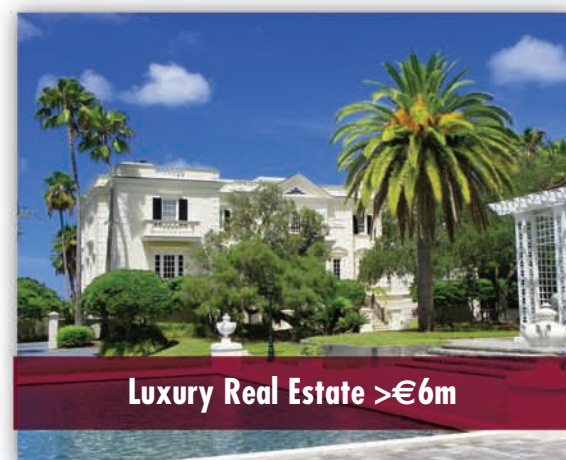
Luxury Real Estate >€6m

Upholding the traditional values of individually tailored advice, product choice and impeccable service.