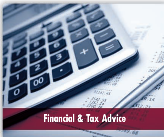
Financial & Tax Advice