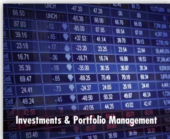
Investments & Portfolio Management

Fiduciary Wealth is the private wealth arm of the Fiduciary Group founded in 1982 and affiliated to Gibraltar's oldest legal practice ISOLAS 1892 which can trace its roots back almost 120 years. The Group is represented in five different countries and employs around 130 staff. Fiduciary Wealth is regulated by the Gibraltar Financial Services Commission with authorised branches in Spain and Portugal as well as an FSA authorised branch in Central London.