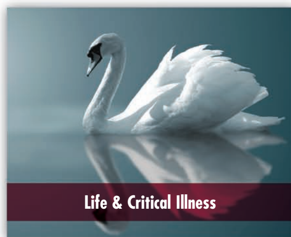
Life & Critical Illness