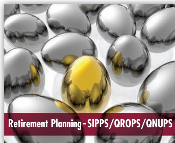
Retirement Planning - SIPP/S/QROPS/QNUPS